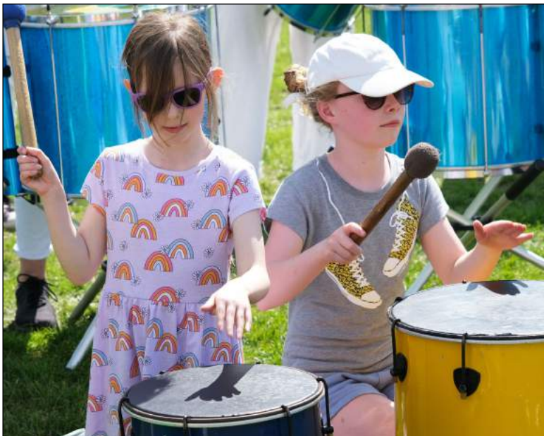
Fun in the sun! Our 2023 May Queen and attendants enjoy their photocall with a heavy police presence! Dad gives this young lady a better view of two trainee drummers.