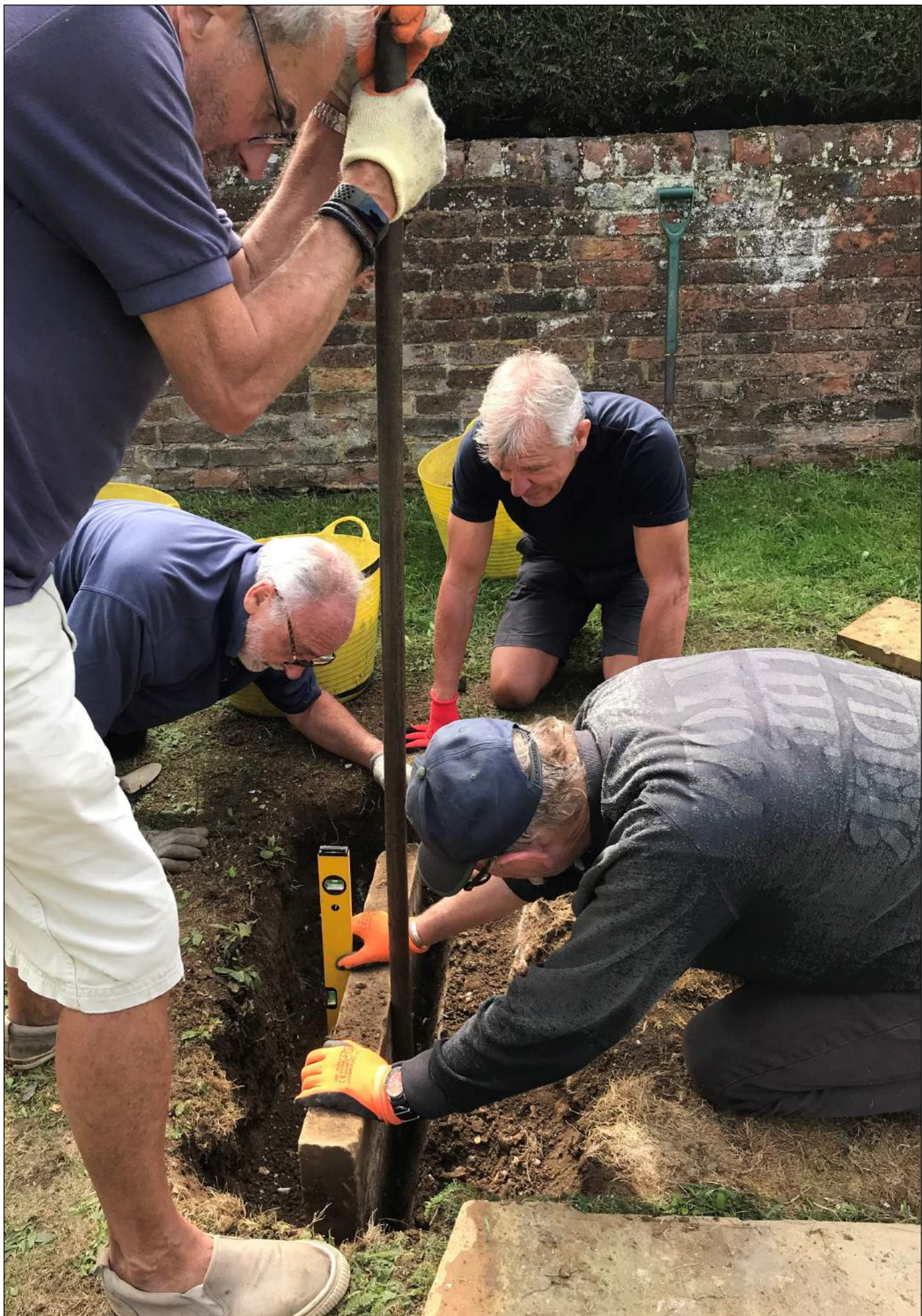
The Bench Boys hard at work in the churchyard